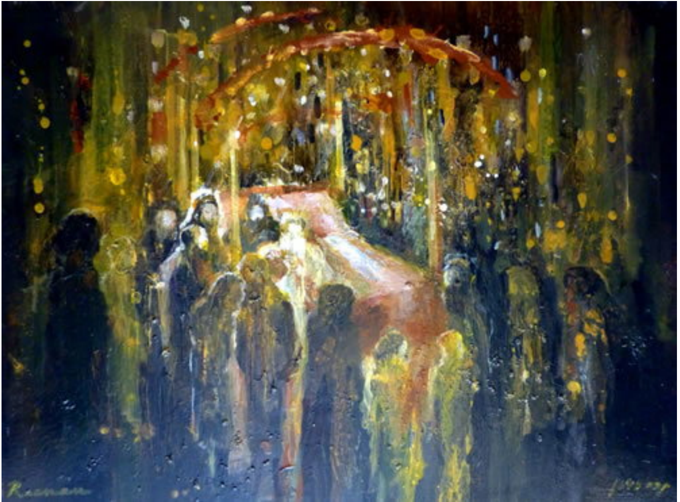
Figure 4. Yoram Raanan: The Blessing of Jacob's Sons

his eyes are darker than wine, and his teeth whiter than milk. Sarna explains: “The phrases express an ideal of beauty: sparkling eyes and shining white teeth.” 38