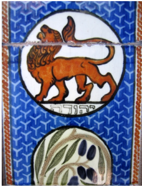
Figure 2. Lion of Judah on a Bezael Ceramic Tile, Moshav Zkenim Synagogue in Tel Aviv-Jaffa, Israel, 1926–1928. 21

9. Judah is a lion's whelp; from the prey, my son, you have gone up. He crouches down, he stretches out like a lion, like a lioness — who dares rouse him up?