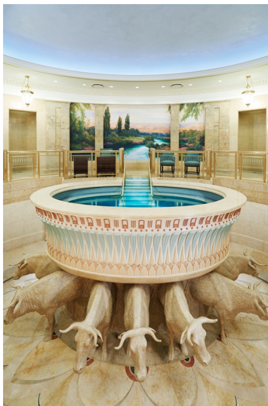
Figure 6. Phoenix Arizona Temple Baptismal Font

Just as the blessing of Judah will have its ultimate fulfillment in the second coming of the Messiah in His glory, so the greatest prophecies of the blessing of Joseph will come to pass through the gathering of Israel in the last days. This means that the primary significance of the declaration of lineage in one's patriarchal blessing is not in its assertion of eventual, conditional blessings, but rather in its reminder of our immediate responsibilities to assist with that gathering — on behalf of both the living and those who have passed on: 72