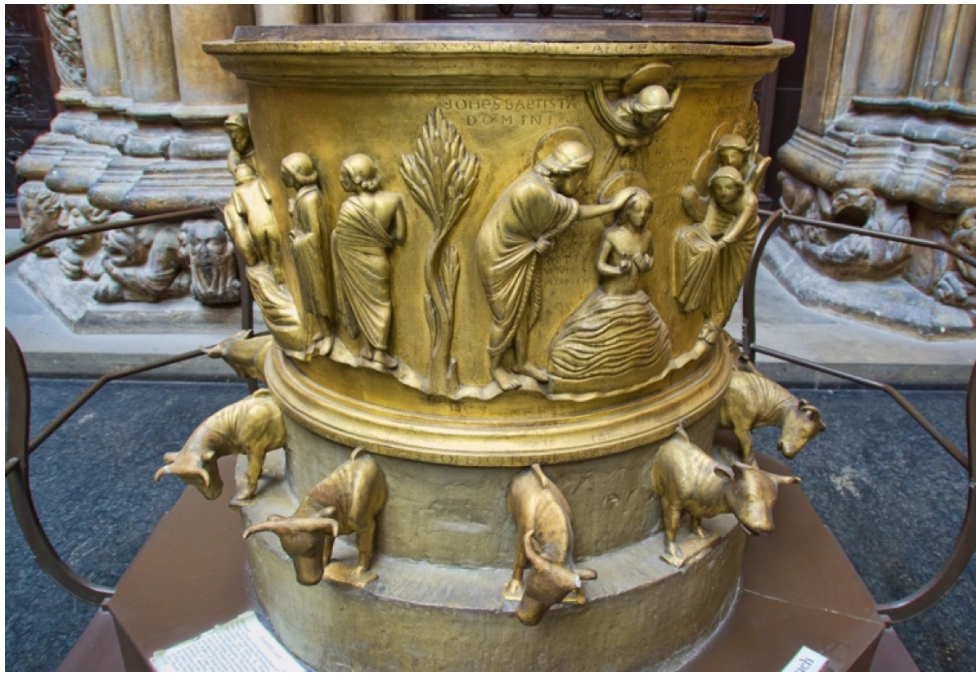
Figure 5. Twelfth-century Baptismal Font. 58